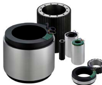
The KBM™ series unique design allows the motor to be directly embedded in your machine, using the machine's own bearings to support the rotor. As a result, the total number of parts count is reduced while eliminating maintenance of gearboxes, belts or pulley.