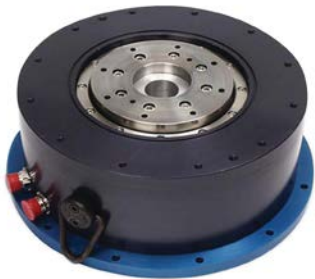
Kollmorgen Housed Direct Drive Rotary (DDR) motors combine large diameter, short length and a high number of magnetic poles to provide outstanding torque density, while eliminating the need for gearboxes, timing belts and other transmission components.

Direct Drive motors are now available in many form factors; for example, Kollmorgen offers Direct Drive Motors in either housed rotary (DDR) , cartridge rotary (CDDR) or frameless ( KBM high-voltage rotary , TBM low-voltage rotary or DDL linear motors ).